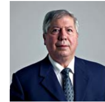
PROFESSOR NABIL AYAD

OF OUR 2011 GRADUATES ARE IN EMPLOYMENT OR FURTHER STUDY